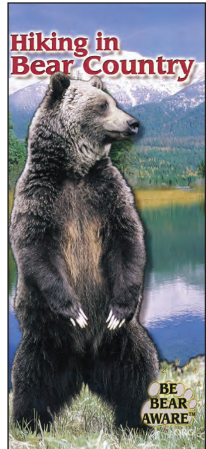
Hiking in Bear Country Brochure