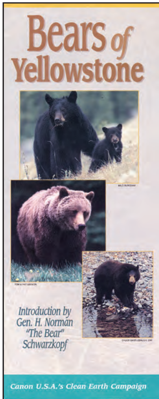
Bears of Yellowstone Brochure