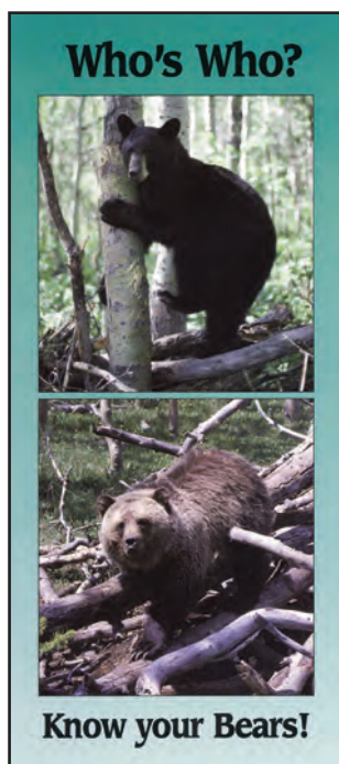
Bear ID Brochure