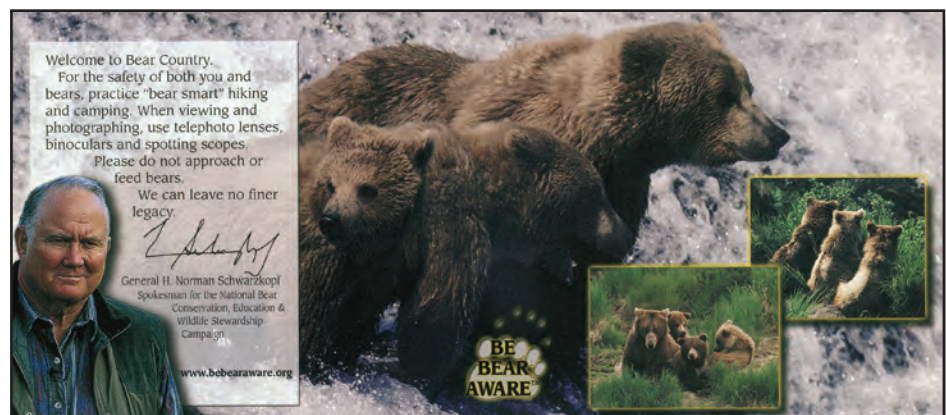
Bear Education Rack Card